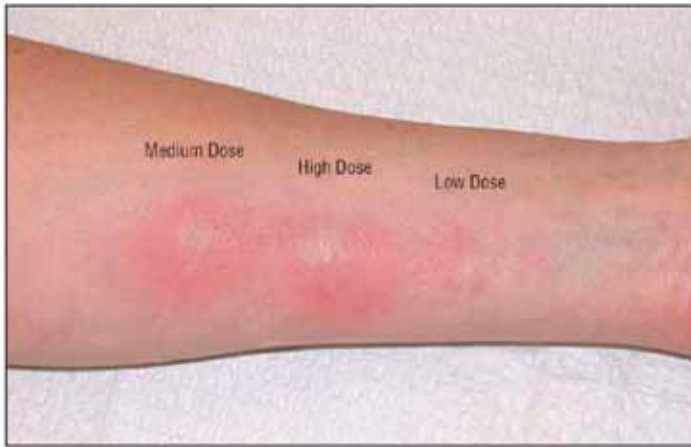
Figure 3. Reactions to different doses of thimerosal-free hyaluronidase. Low, medium, and high doses were equivalent to 10, 20, and 30 U of drug, respectively. Reproduced from reference 83, with permission.

facturers produce hyaluronidase as an API rather than via FDA current Good Manufacturing Processes (cGMP) for approved products.